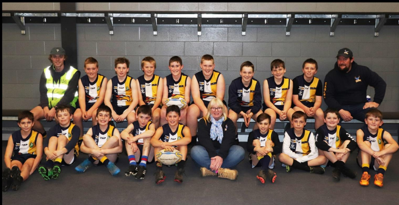
Western Eagles Football Netball Club

Well done boys! We look forward to bigger and better things which will definitely come as the years go on.